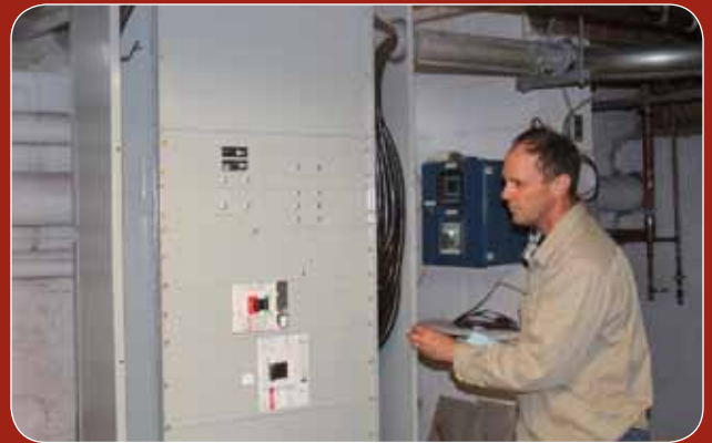
An electrician works to upgrade the systems in St. Joseph's Hall.

Efforts to spruce up and modernize the Malvern Retreat House campus have been going strong in the last few months.