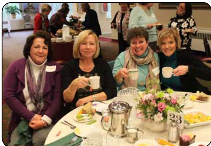
Ladies enjoy tea together at the Sunday Women's Teas: Feminine Heart: Whole & Holy .