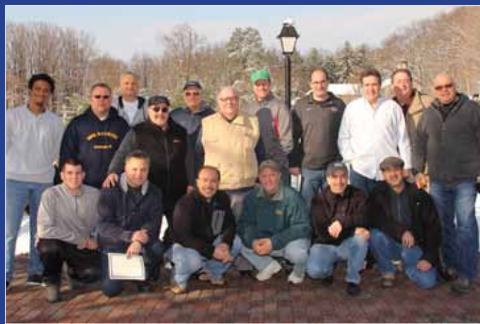
Some Caenaculum retreatants pose for a picture in the spring snow (top).