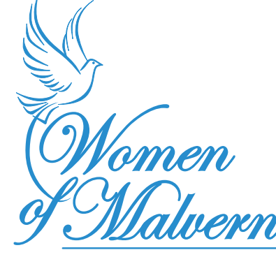
Come As You Are All Are Welcome!